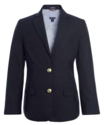
Navy Blazer* brass or navy buttons. *School logo is REQUIRED