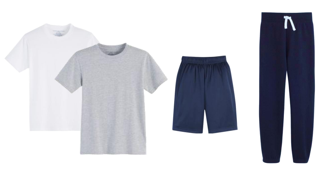
Solid White or Gray T-Shirt No tank tops, sleeveless shirts, or compression shirts No words, logos, or graphics permitted