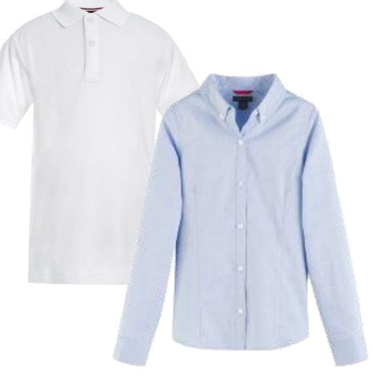
White or Light Blue Collared Shirt*

(long or short sleeves, polo or buttondown/Oxford style) *School logo is REQUIRED