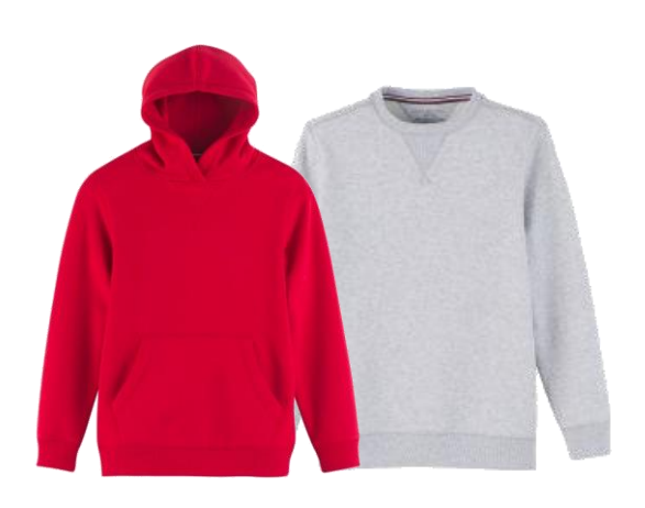
Optional: Red or Gray Sweatshirt* (pullover/crewneck or hooded style) Solid color; no words or graphics permitted