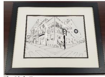
The Little Town Arina Ignatyeva