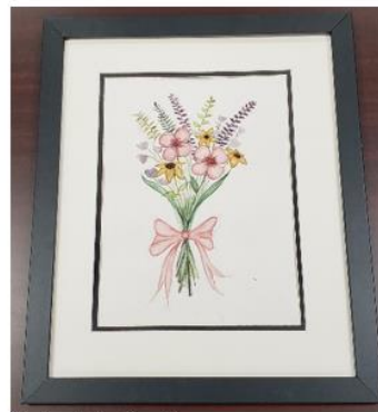
Spring is in the Air Manya Dadu