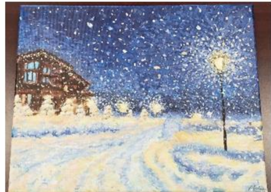
Winter's Eternal Light Lily Kuehn