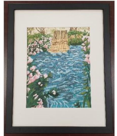
Relaxation Ashley Vo